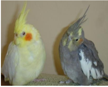
Sunny & Piper